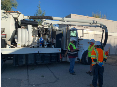
RVSD Vaccon Competency Training

Click here to review our Frequently Asked Questions (FAQs) that explain sewer overflows and what to do.