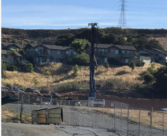
Drill Rig installing piers for shoring walls at Larkspur Landing

This project is anticipated to be complete by the end of October 2020. The schedule is subject to revision to coordinate with the construction of the Marin County Upgrade the Drake Project . Pavement restoration will meet County standards. Check out the Laurel Grove Project webpage for more information.