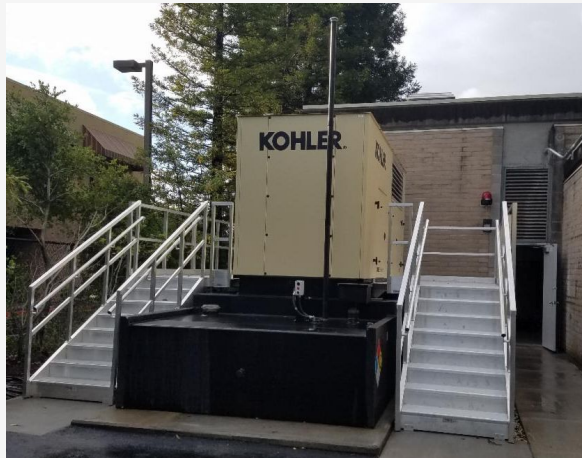
Greenbrae Pump Station 13 Generator

Typical outages we experience last an hour or less, usually 15-30 min. The longest outage we've had in recent years lasted around four hours. This recent outage was in place for approximately 45 hours (8:30 pm Saturday to 6:00 pm Monday). Seven of our 19 pump stations have generators that automatically activate and power the pumps. Our 12 smaller lift stations require a few hours to check, switch on a portable generator and pump down, about twice a day. The City of Larkspur owns one of these generators and RVSD provides the fuel. Most of the generators have a diesel fuel tank that we ensured were "full" before the power outage. All were over half-full at the end.